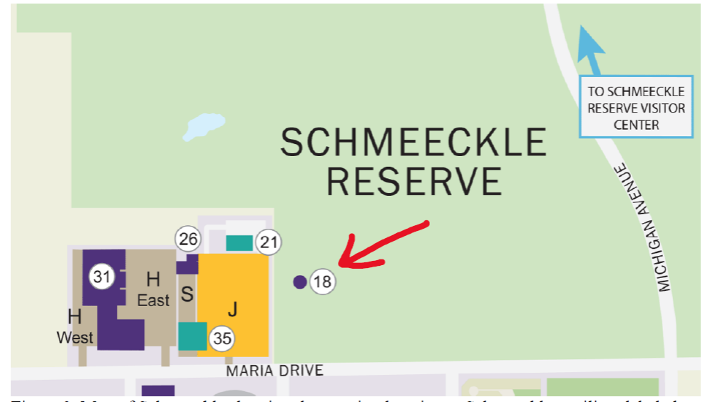
Figure 2. Map of Schmeeckle showing the meeting location at Schmeeckle pavilion, labeled number 18.